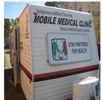
UPFH Mobile Medical Unit in Midvale Utah in September 2008

Utah Partners for Health does not provide any direct healthcare services. UPFH only assists in funding access to healthcare services that are provided by independent healthcare professionals who are willing to donate a substantial portion of their usual billing to the underserved.